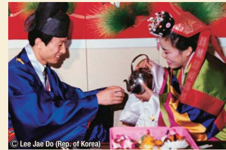
© Lee Jae Do (Rep. of Korea)