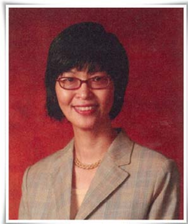
Dow Chemical Thailand Limited