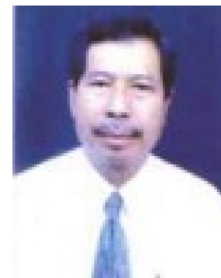
Unithai Shipyard and Engineering Limited