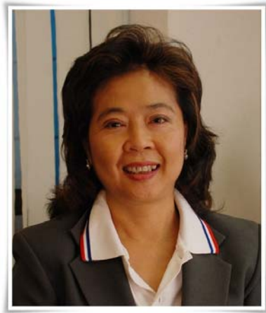
PTT Chemical Public Company Limited