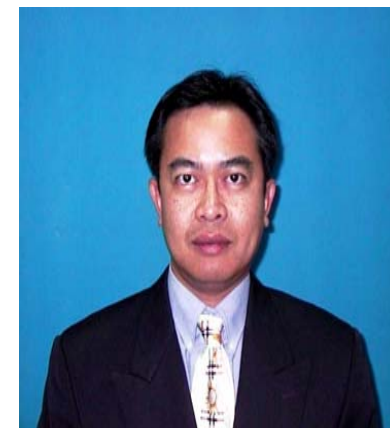
PTT Exploration and Production Public Company Limited