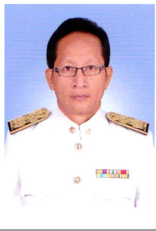
Electricity Generating Authority of Thailand