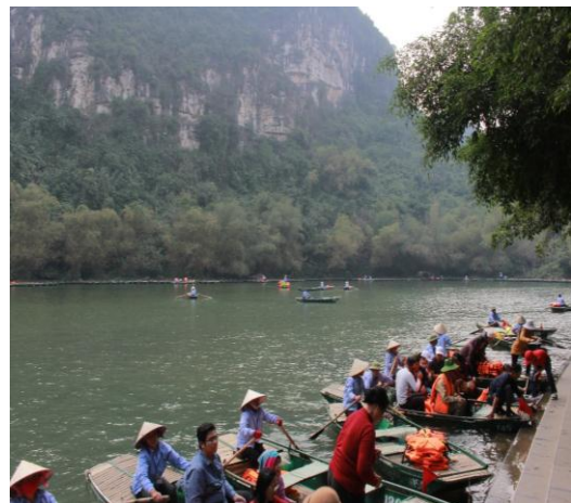
Boat tour in Trang An, Truong Yen commune, Ninh Binh, Viet Nam

Interested in this unique arrangement, CECR conducted research in Truong Yen commune, the largest of twelve communes in Trang An’s 122 km 2 area. Like other nearby communes, Truong Yen has seen dramatic changes in recent years. Tourism has transformed the once rural landscape into a peri-urban one with concrete road systems, houses, and other hard infrastructure. Previously mainly agricultural, many residents now supplement agricultural livelihoods by working in tourism as boat riders or performing other tourism-related services (e.g. waitstaff, taxi drivers, food vendors, construction, etc.).